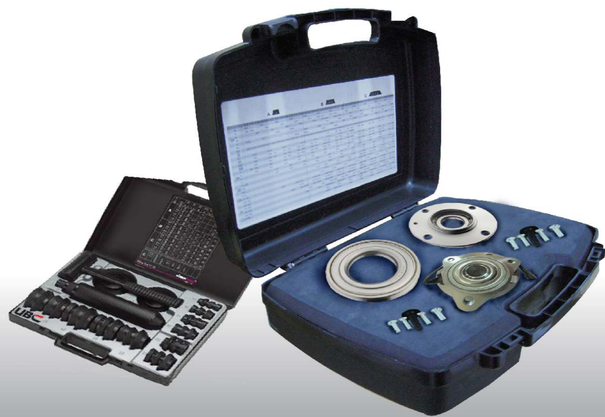
Kit for Bearing Installation