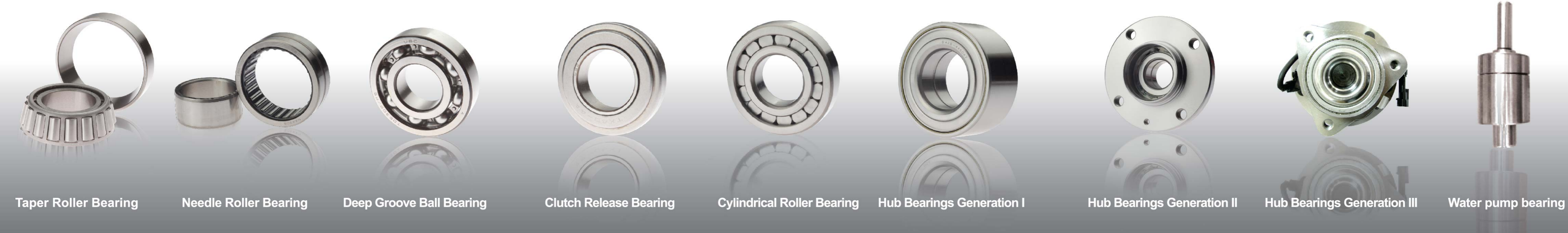
Taper Roller Bearing Needle Roller Bearing Deep Groove Ball Bearing Clutch Release Bearing Cylindrical Roller Bearing Hub Bearings Generation I Hub Bearings Generation II Hub Bearings Generation III Water pump bearing